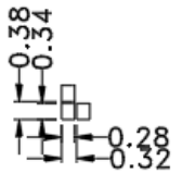
DOT DETAIL SCALE 5:1